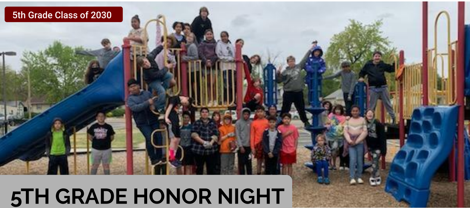
5th Grade Class of 2030